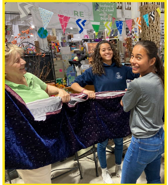
This fall, our students were active in the community with our annual Service Day. Students spent the day in the community helping others in need. Our students also headed to Ft. Myers to help with hurricane relief.