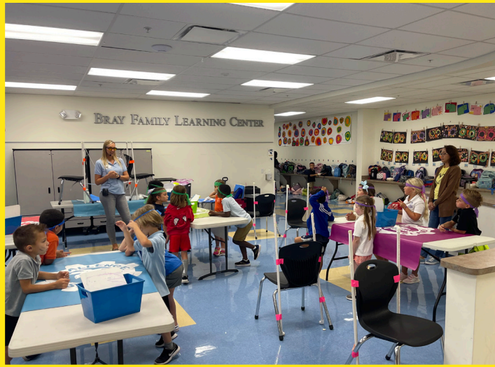
Elementary students enjoy hands-on learning with our STEM program which takes place in the Bray Family Learning Center.

Opportunities for hands-on experiential learning is never far away. LWC students are actively involved with tangible learning through doing and seeing.