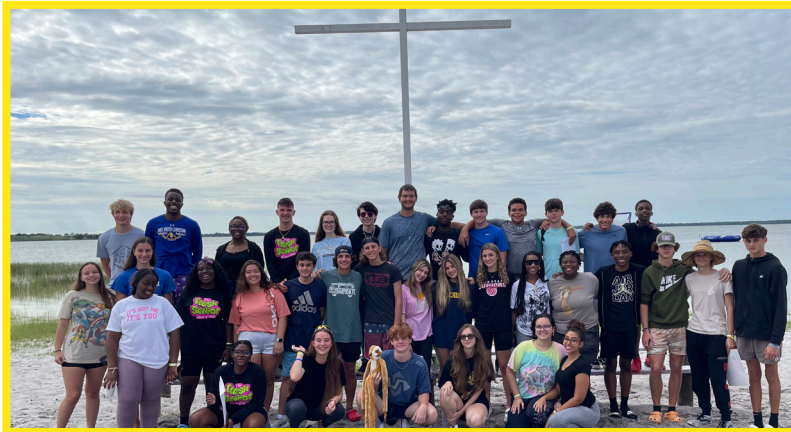
The 2023 senior class traveled to Lake Placid for a time of bonding and spiritual enrichment during their annual senior retreat.

LWC focuses on our students spiritual well-being and our surrounding communities