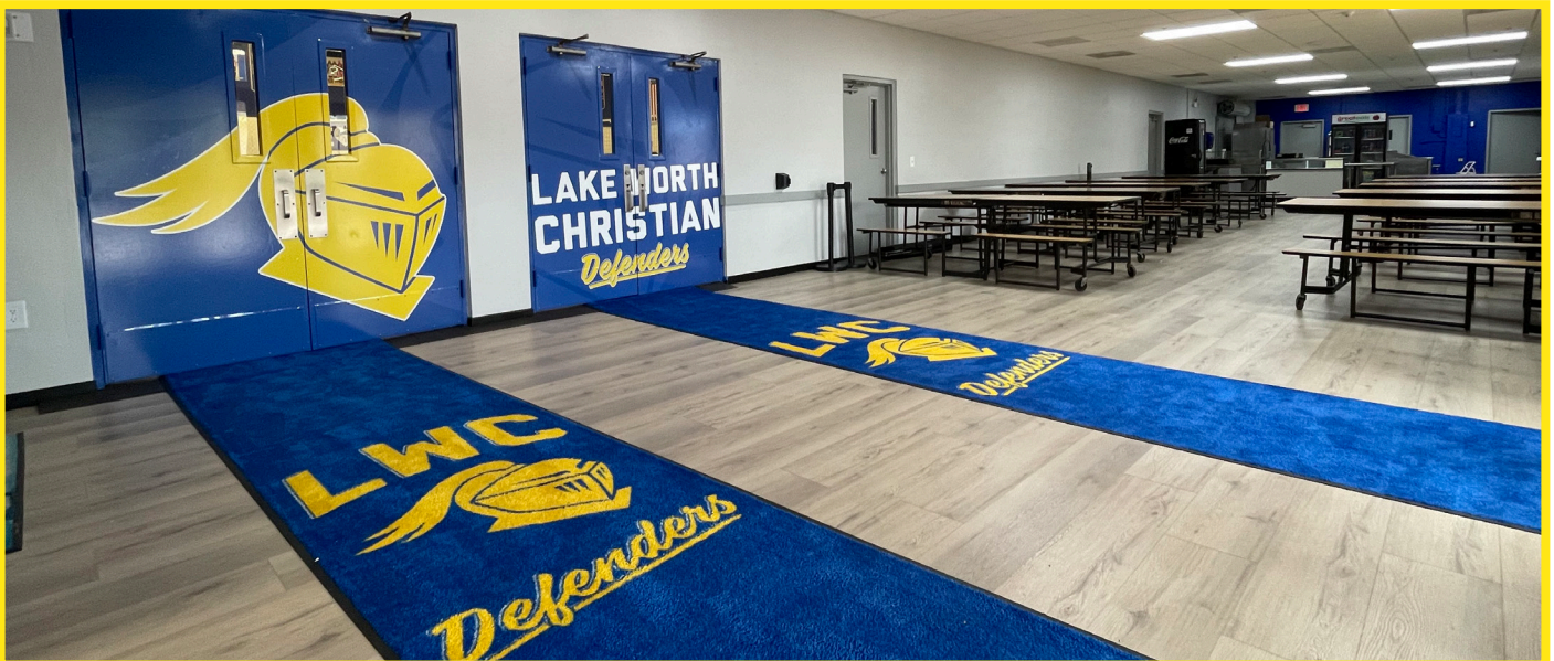
New door wraps and floor mats (bottom) welcome you as you enter into the LWC gymnasium and the updated cafeteria.