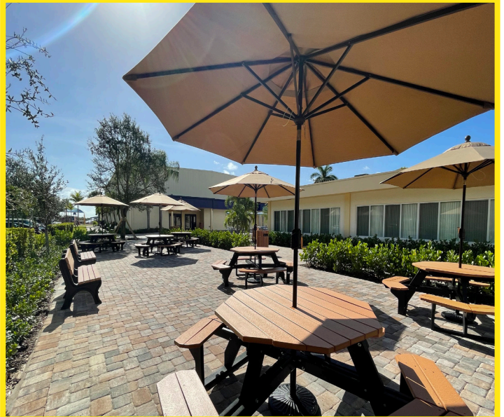
Tables and benches have been added to provide more outdoor areas for students to congregate, have a snack and eat their lunch. (left picture - new oak tree welcomes students as they enter campus | right picture - completed picnic area in front of middle-school building)